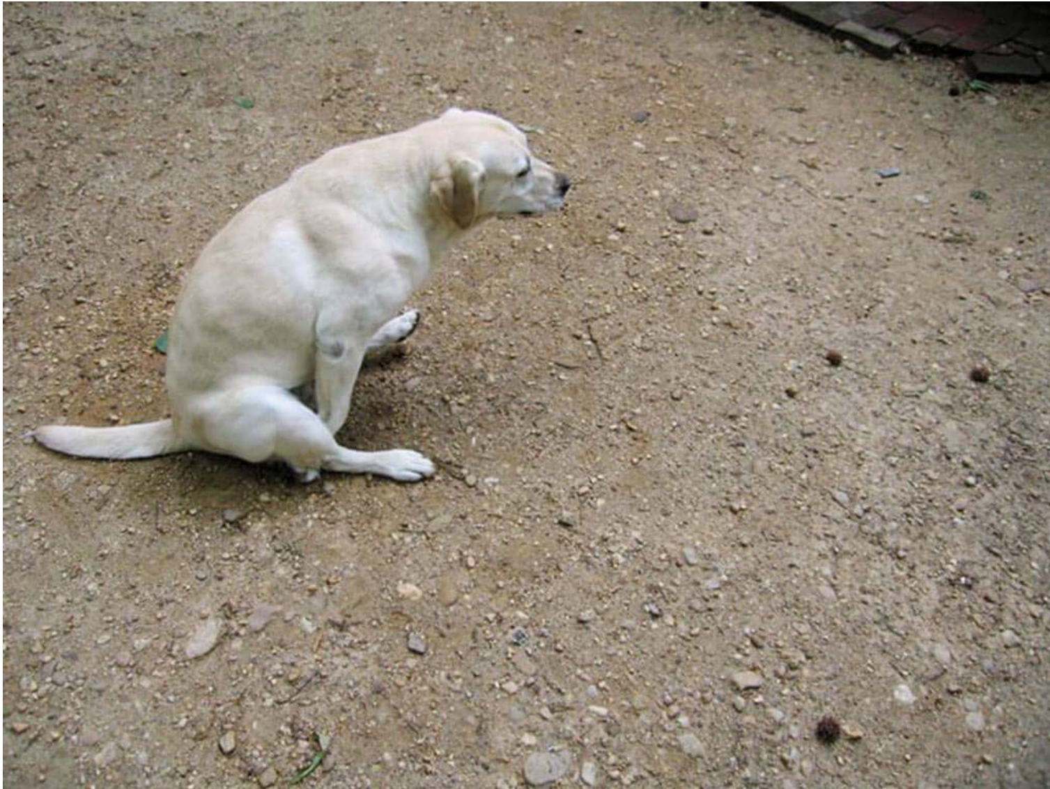
Dragging Their Bum

It might look funny when your dog drags their bum, but you should be concerned. Called scooting, dogs often do this when they have an impacted anal sac they want to release. Certain dog breeds suffer from it at higher rates. This can be truly uncomfortable, so make sure to bring your pal to the vet right away.