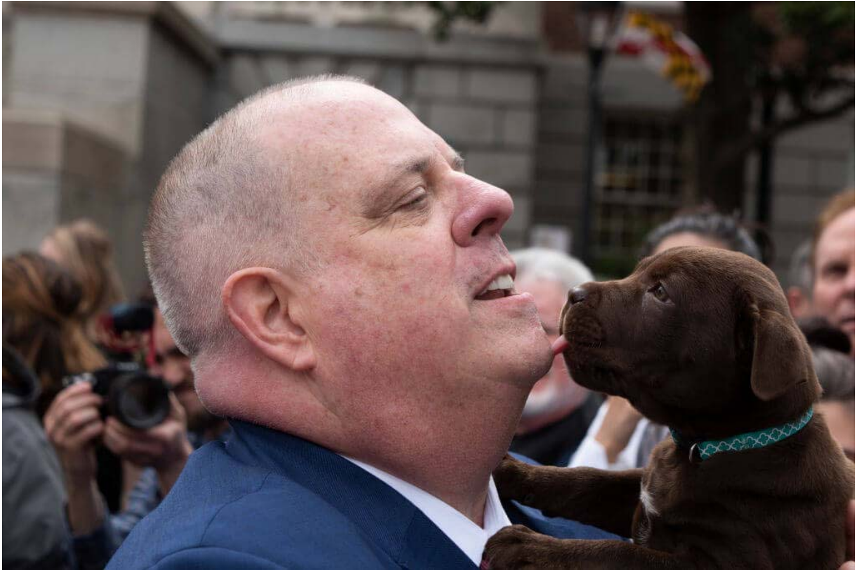
Raising Their Paws

A dog raising their paw might mean that they are looking to play or need something from you. Most pups and young dogs display behavior like this. When a pup wants to eat, it often puts their paws out for their mother. A puppy doing the same thing to you means that they want affection and love!