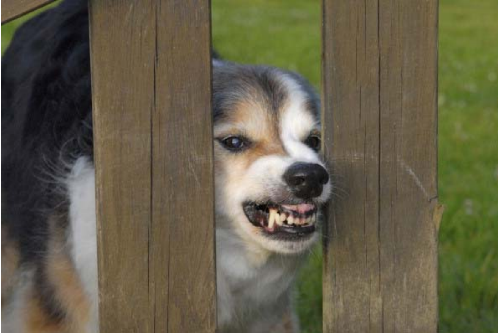
Snarling And Showing Teeth

Dogs show their moods in a variety of ways. They are not always positive. A dog wrinkling their muzzle means aggression. If they ever snarl and show their teeth, it is important for you to remove them from whatever is going on. After all, it means that they are ready to attack at a moment's notice.