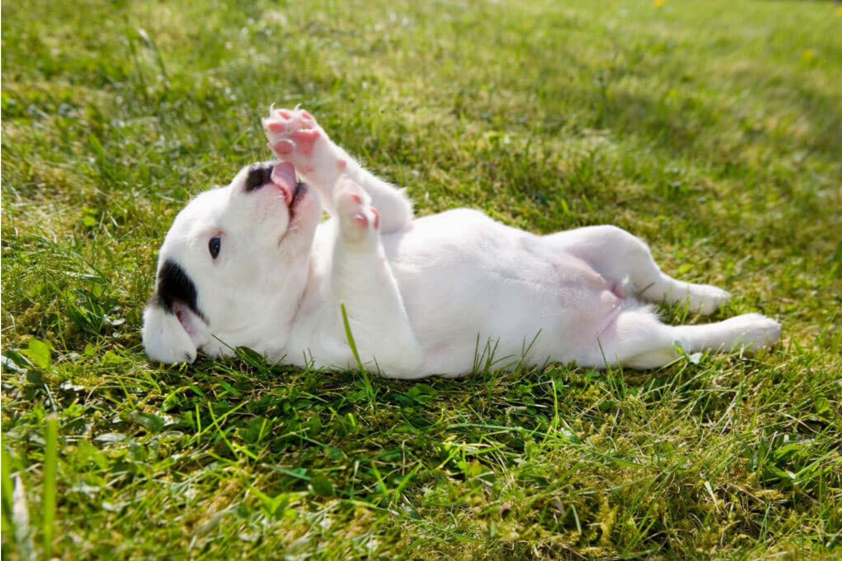
Licking Themselves Clean

It is not a secret that dogs clean themselves by licking their bodies. When your dog is dirty, they will try to lick himself clean. However, it can mean that they are hurt as well. A dog licking their paws and legs a lot will mean a trip to the vet, especially if they do this near the joints. Better safe than sorry!