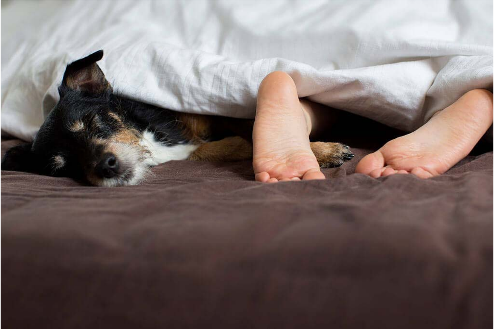
Sleeping Beside You

Do not be offended if your furry friend likes to skip the dog bed and lay down beside you. They got it from their ancestors! Their forebears hunted in packs and slept together for security and warmth. Your dog only wants to get close to you. Take it as a compliment that they trust you enough to even do this.