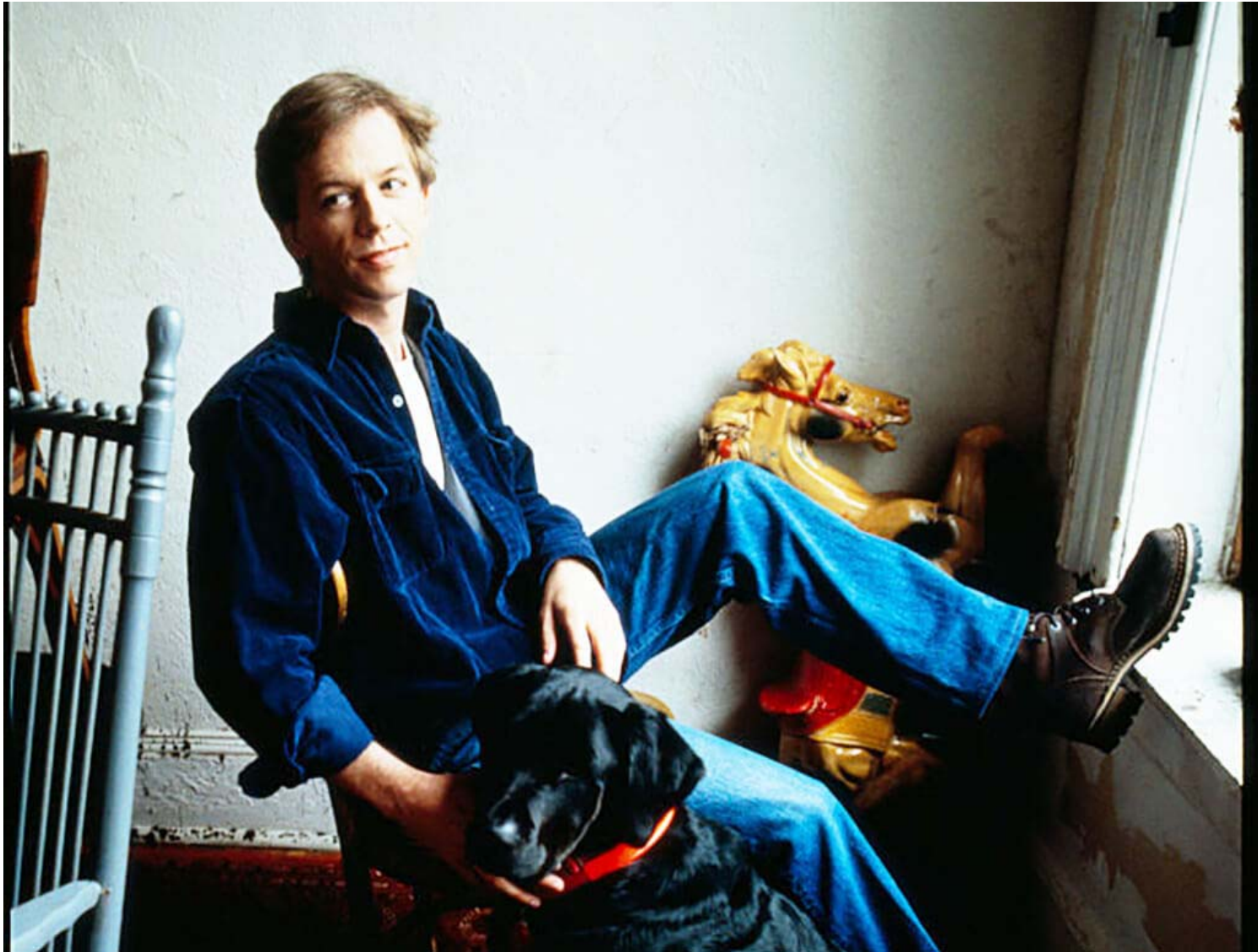
Leaning On You

If your dog leans on you while hanging out, you should be flattered! It is the equivalent of a hug for them. They are not being lazy. No, they only want to connect with you. Do not nudge your dog off the next time that they do this. We highly recommend simply letting them express affection in that way.