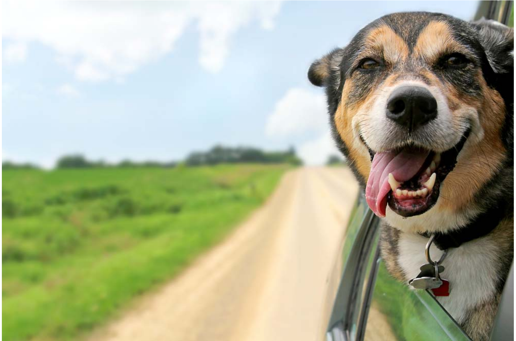
The Side Tongue

It is cute when dogs hang their tongues out of their mouths. It is a signal that they feel happy and calm! It will happen when you go out for a walk or play fetch. Excessively doing this might mean they have the “hanging tongue syndrome,” which is common among dogs with flat noses like bulldogs or boxers.