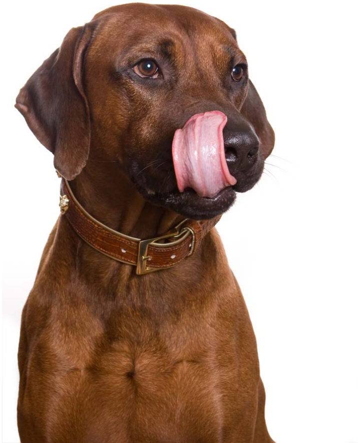
Flipping Up Tongues

When dogs think they did something wrong, they might stick out their tongue and flip it up to apologize. They feel guilty and feel apologetic. It might also be their own way of putting on an innocent face. After all, who can possibly resist such an adorable face? Expect this look when they pee on the floor!