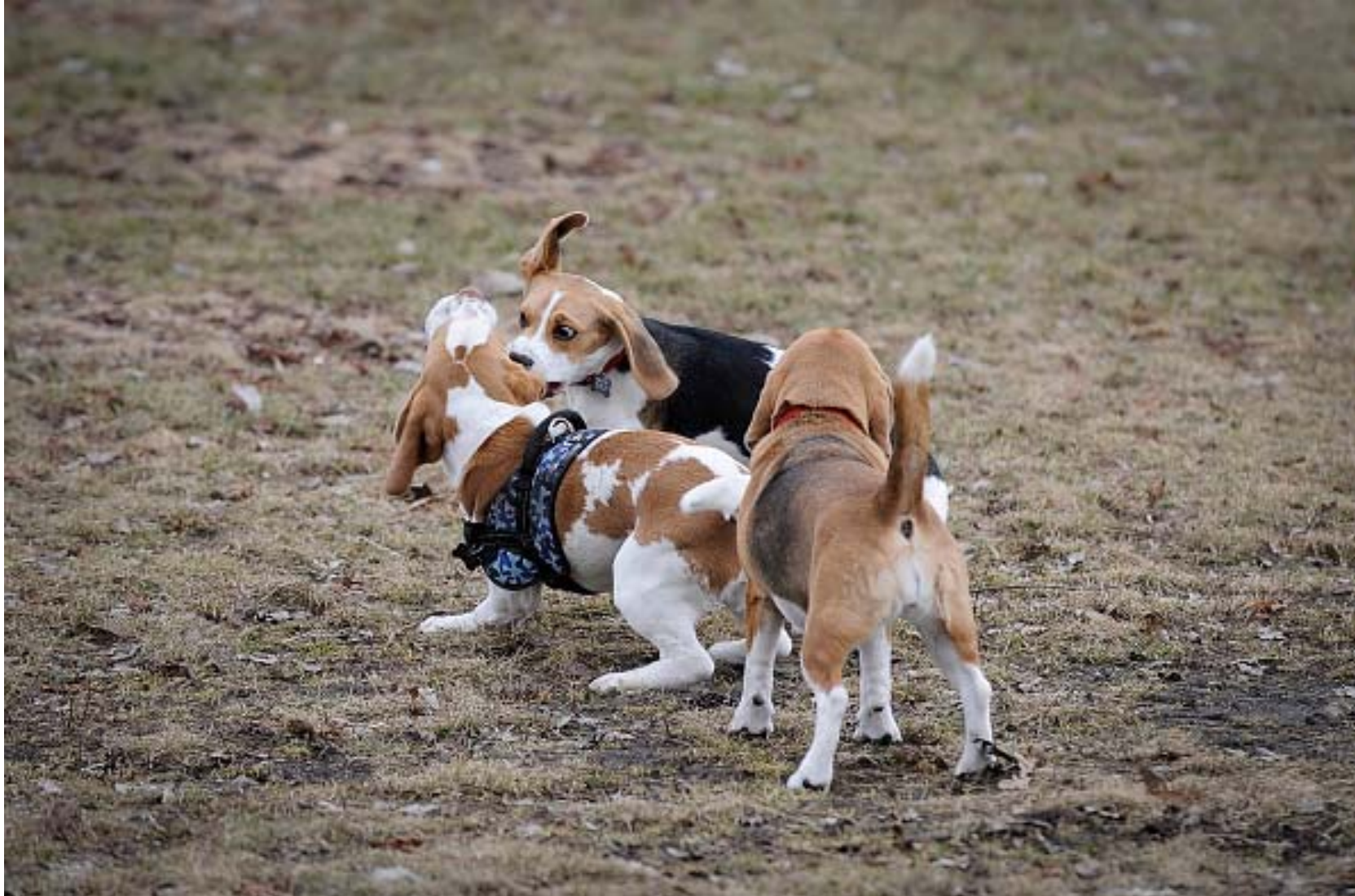
Why They Bite

It is not at all pleasant when you are bitten by your dog. However, it can mean playfulness and affection! Dogs bite one another when they play together. It is not considered aggressive, and this behavior carries over to the way they act towards you. Make sure to look out for signs of fear or aggression, however.