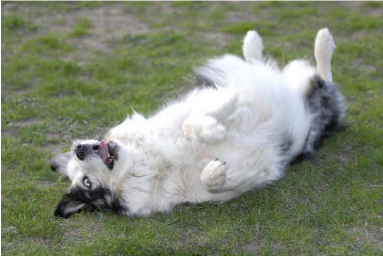
Exposing Their Belly

When your dog shows you their belly, it means that he respects you and feels submissive. Perhaps they also want to play with you. The only way to respond here is to rub their belly! They will want it to happen again and again, so they will keep doing it. However, they also display this behavior when they are getting attacked by some other animal.