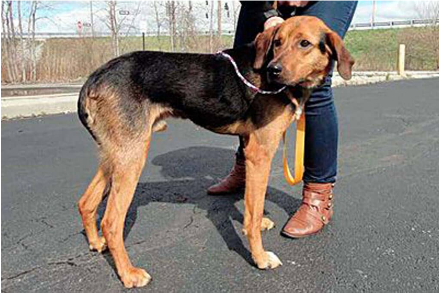
Tucking Their Tail

Your dog might be in distress if he tucks his tail in between his legs. These creatures do so when they are scared, ashamed, guilty, nervous, or uncertain. If your dog does this, it is a good idea to comfort him and ensure that he feels safe. Why not pet him and talk to him in a soft voice? Doggie treats also work well!