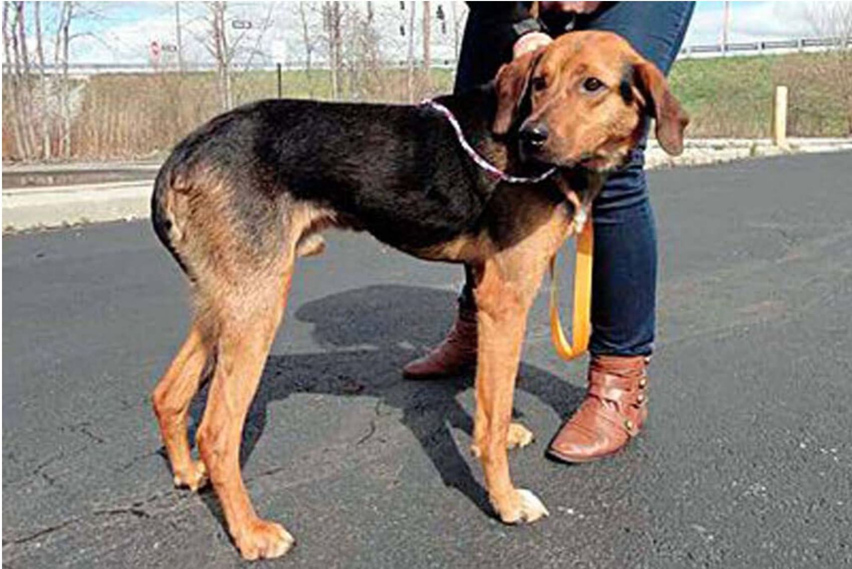
Using Their Tails

It is no secret that a dog wagging their tail means that they are happy and excited. However, it can mean submissiveness when they hang the tail down as they do so. If you ever see a dog do this, show them love, affection, and security. When they wag it high, however, it means that they are alert and playful!