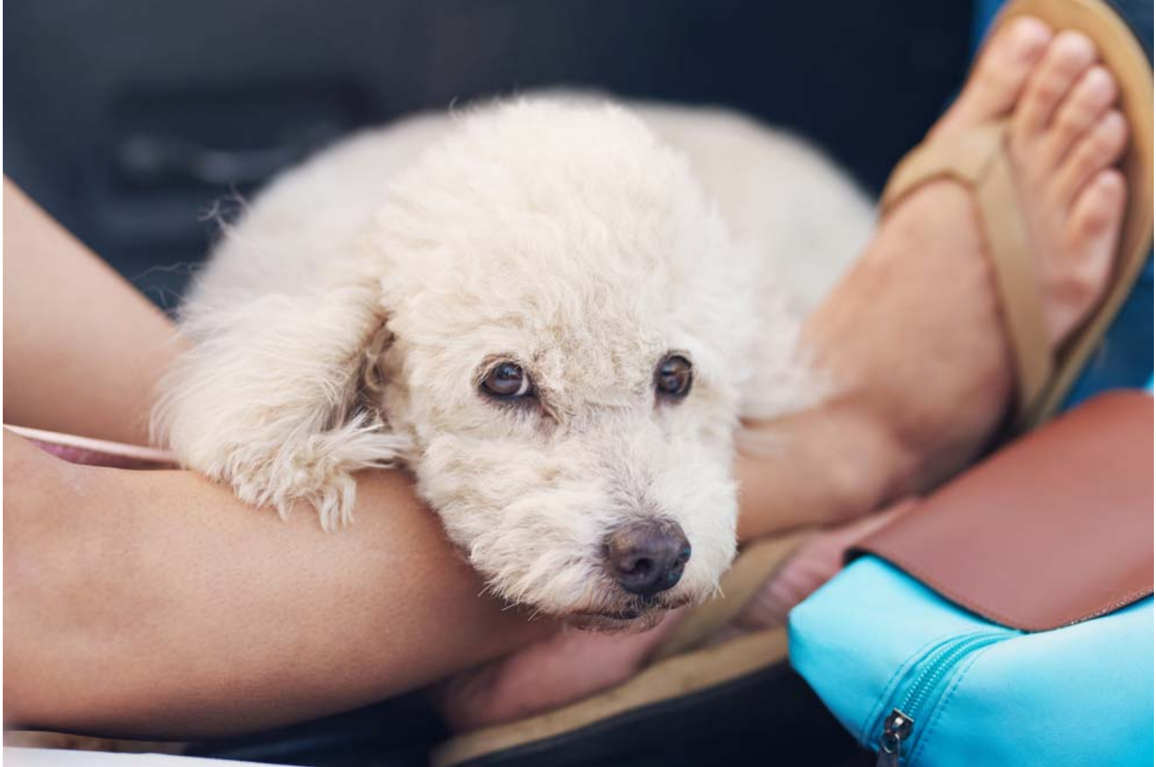
On Your Feet

Dogs like to lay on your feet when you are eating dinner or watching TV. It might be a little annoying, but your dogs mean well! This is their way to show their love and loyalty. They only want to be as close to you as possible. It is behavior that they got from their ancestors when they used to run as a pack.